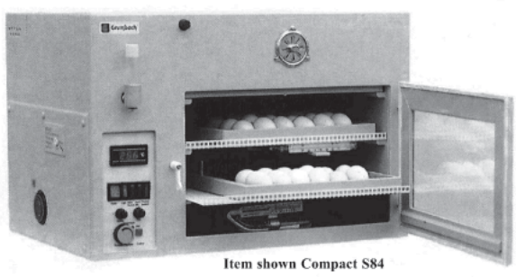
Larger units available