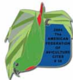
#18 Blue-crowned Hanging Parrot