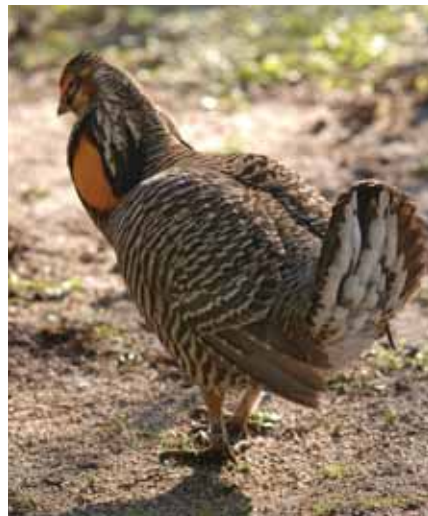
Prairie Chicken "Booming".

Construction began a few months ago. Rainy weather delayed our progress somewhat, but construction of the first set of pens should be complete and ready to receive adult birds by this summer. Plans are to add a hatching-and-rearing facility next year and then two additional sections of pens, which could help triple or quadruple current chick production! ■