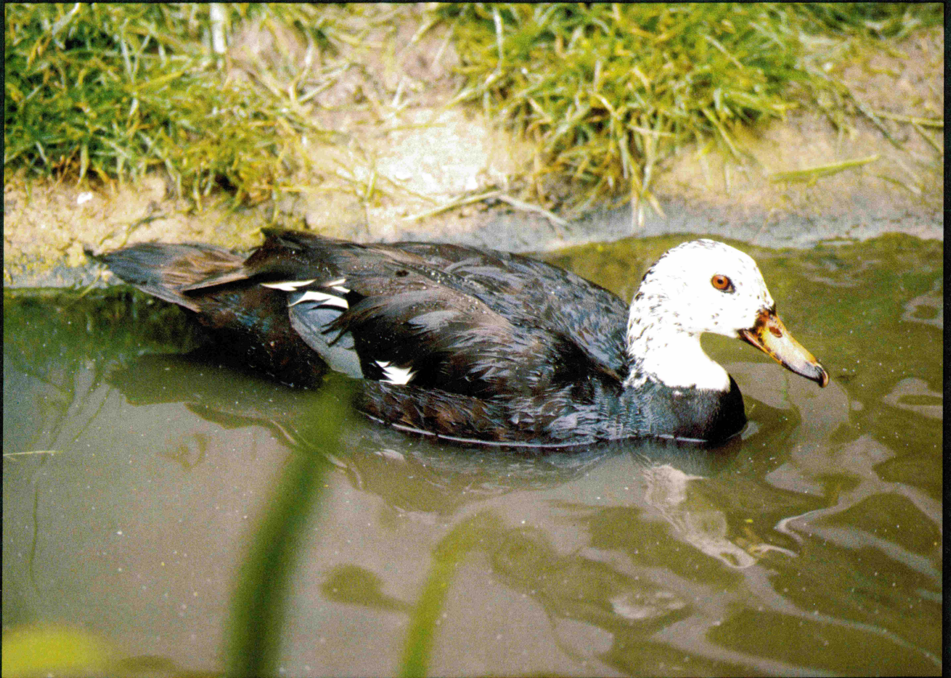
White-winged Wood Duck, Cairina scutulata