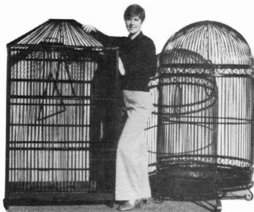
#235C 22" x 36" x 60"

ALSO CUSTOM MADE CAGES TO YOUR SPECIFICATIONS