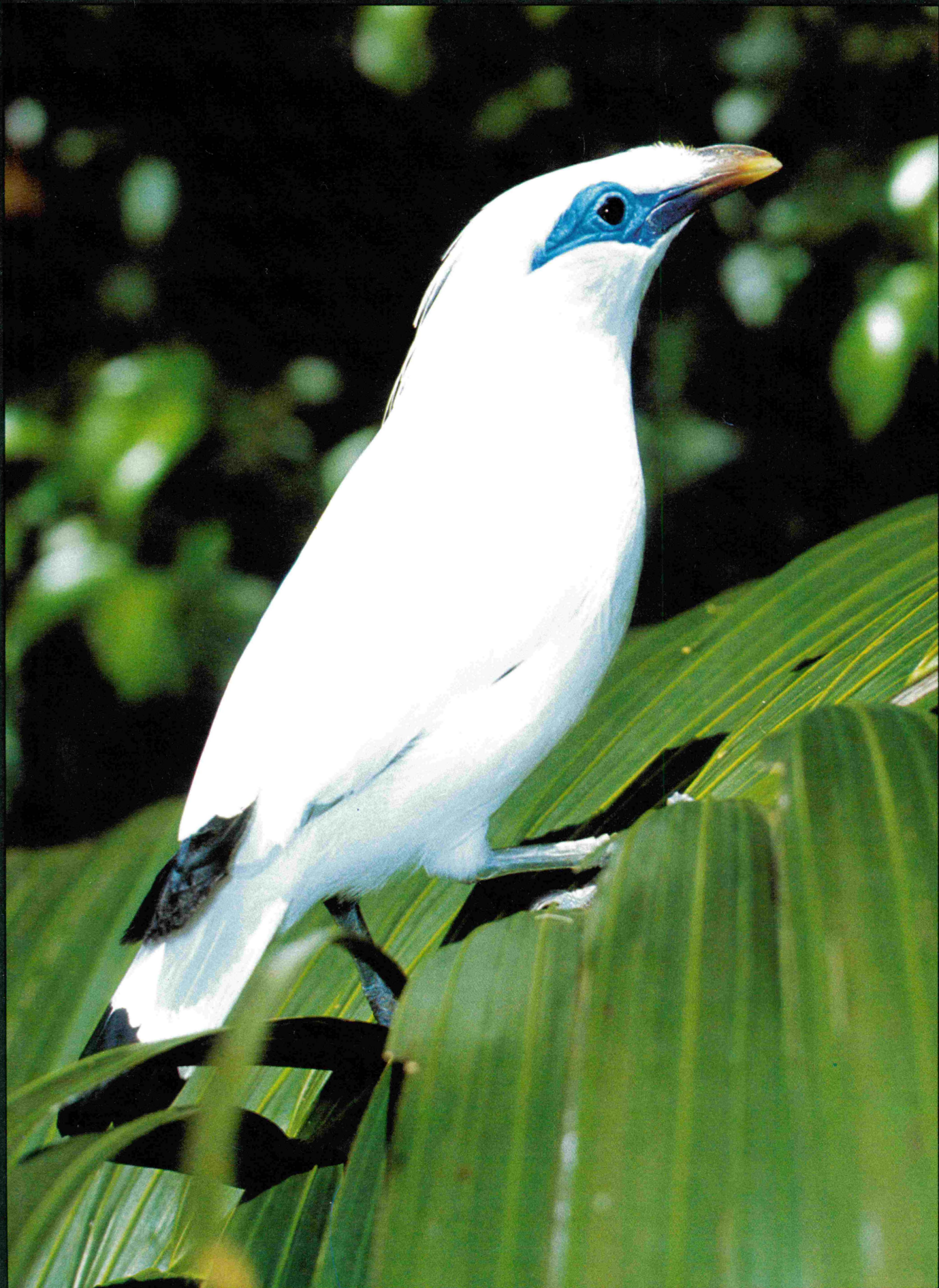
Bali Myna, Leucospa rothschildi