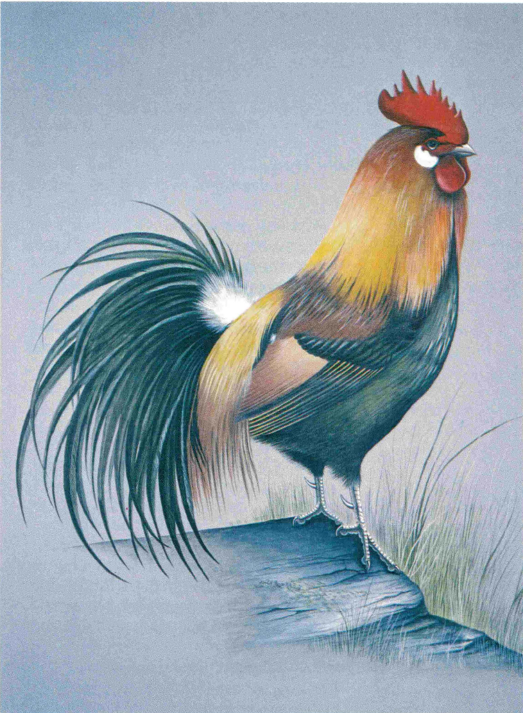
Burmese jungle fowl

This page displays a small sampling of Eric Peake's beautiful watercolor paintings.