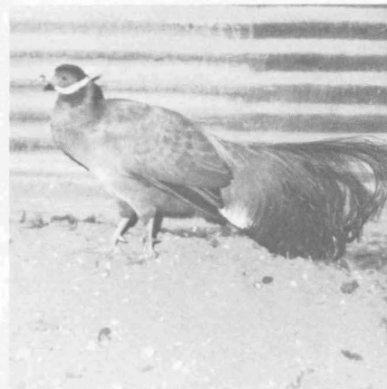
Blue Eared – "Mr. and Mrs." look very much alike. They also enjoy the reputation of being one of the noisiest of pheasants.