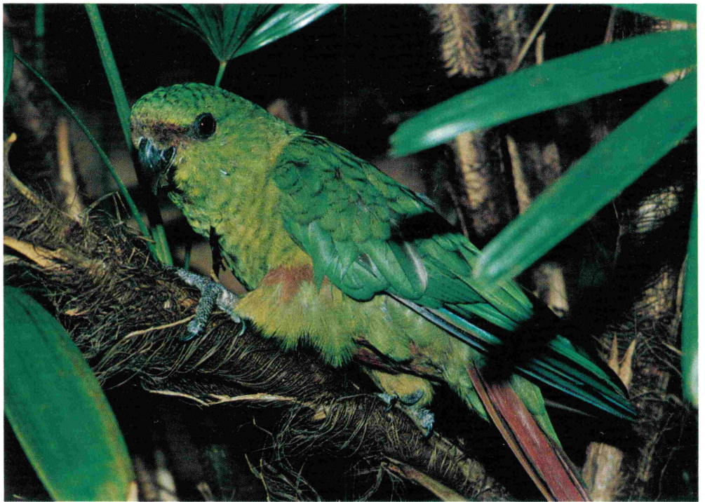
Austral conure in a raphis palm. Note how the cere is feathered.

terior with wire in order to prevent its destruction. Despite their smaller bills, Australs chew wood no less voraciously than other conures! Pine shavings were placed in the box to a depth of four inches, and this was the only nesting material used.