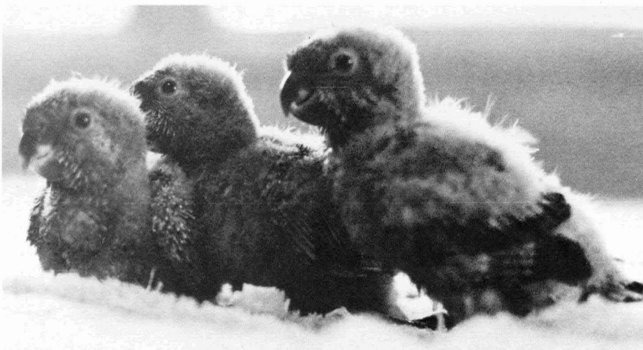
Baby austral conures raised by Tom Ireland.

The definition of the word "austral" is "southern"; and, as that name implies, the Austral Conure occupies the most southerly range of any parrot. Its native habitat is Southern Chile and Argentina extending to the island of Tierra del Fuego.