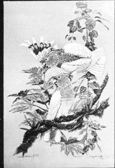
MAJOR MITCHELL'S COCKATOOS