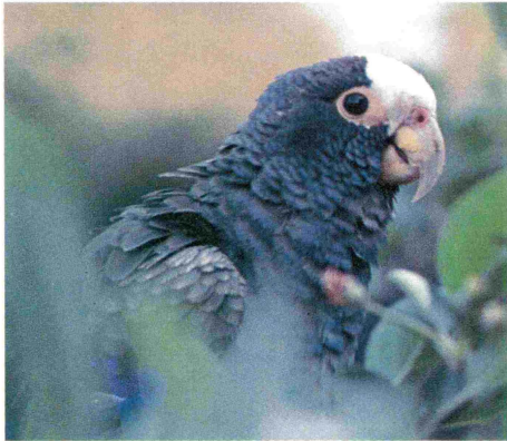
White-capped parrot ( Pionus senilis )