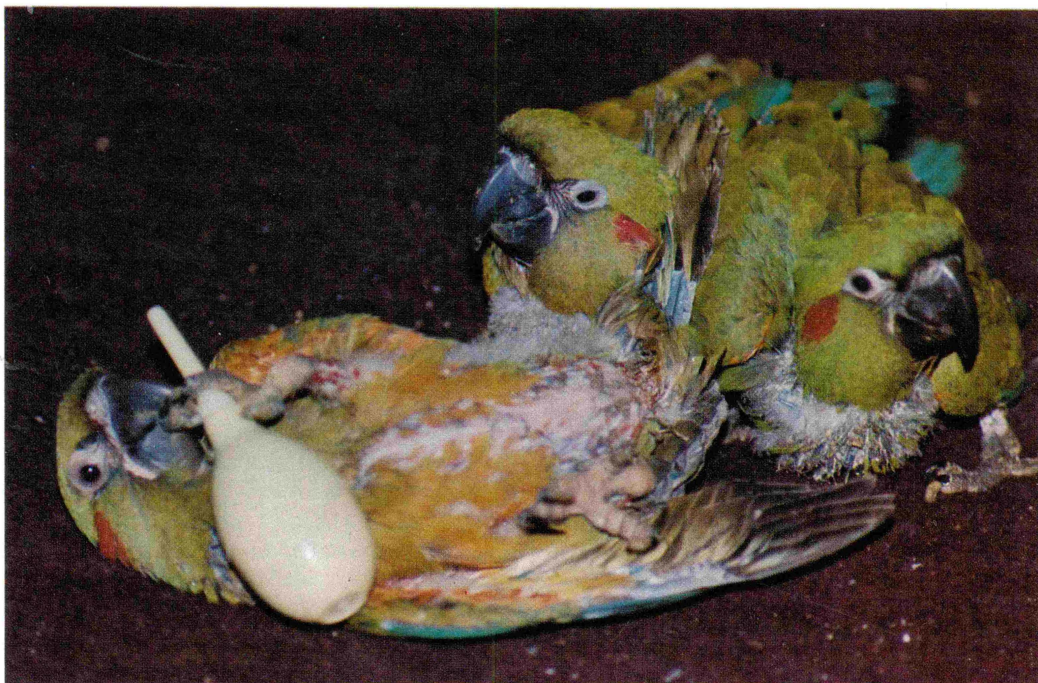
Having fun after their feeding, six weeks old.