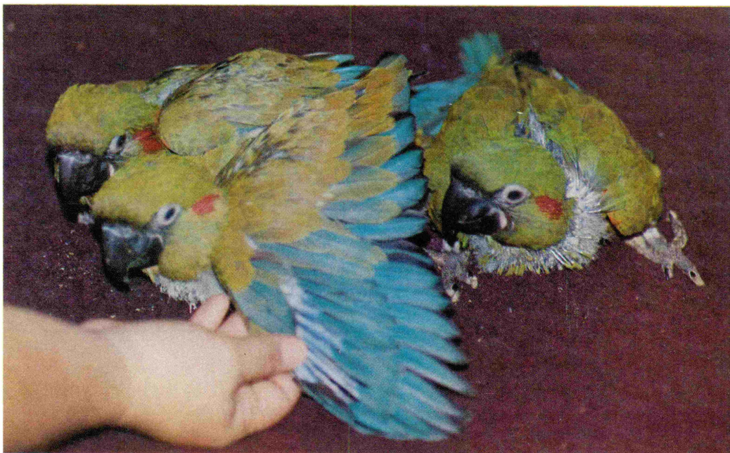
Youngsters feathering out nicely at six weeks of age.