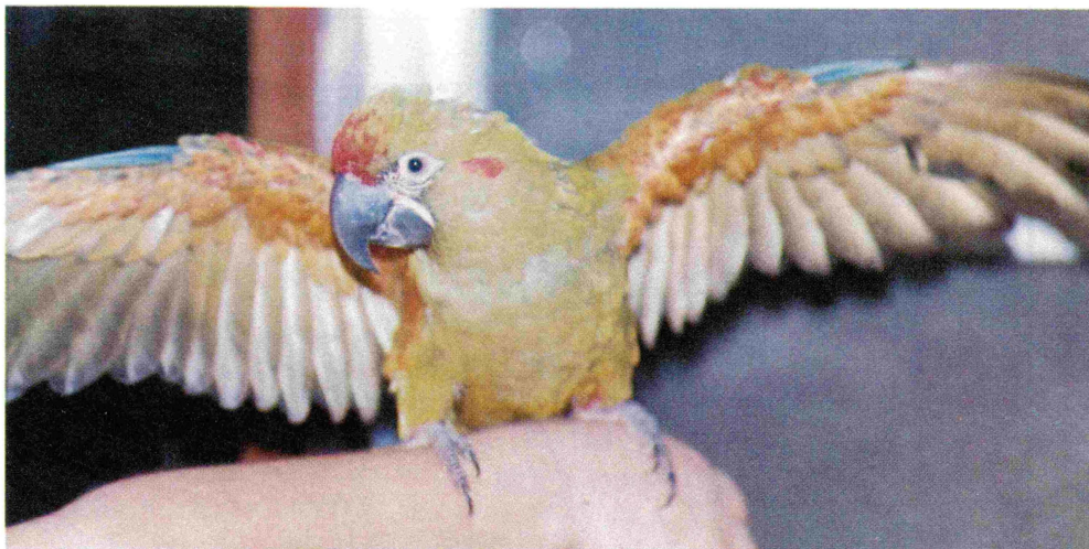
Young hen red-fronted macaw shows colorful underside of wings, age 29 weeks.

10441 Barbara Ann - dept. W Cypress, CA 92630