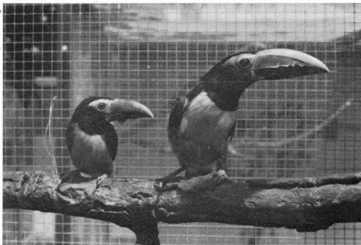
Green aracari mother (right) with son.

nest chamber excavation stimulates the birds sexually and cements the pair bond.