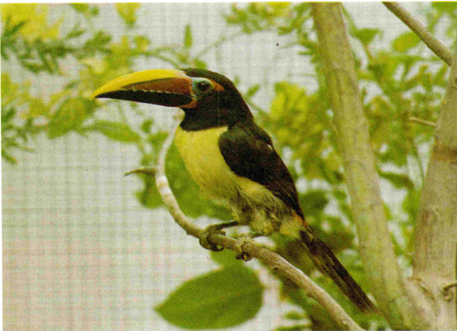
Adult male green aracari ( Pteroglossus viridis )