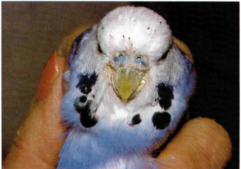
A bad case of scaly-face. Notice the scale creeping around the lower mandible of the bird.

SICK BIRDS will be found in every fancier's birdroom at one time or another. When a sick bird is detected it must be