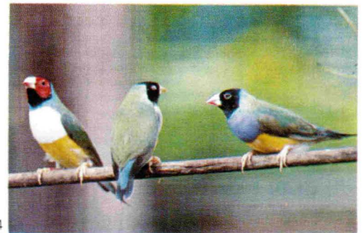
WHITE-BREASTED & NORMAL LADY GOULD FINCHES

Rose and Cinnamon Bourkes, Scarlet Chested Keets (permit required), White-Breasted Gouls, White-Faced Cockatiels, Fawn Shafttails. normals of these species. Splits and possible splits of color varieties available at reduced prices.