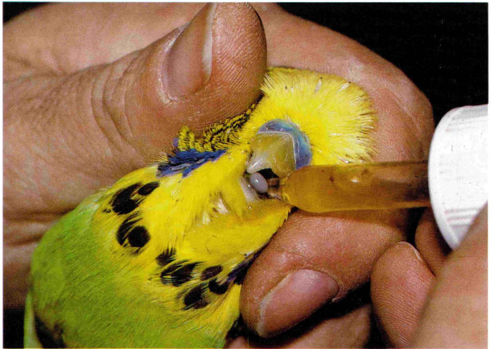
When medicating birds by mouth be sure to place the dropper behind the tongue.

not put the eggs directly in water. If the egg is cracked the chick may drown. Too little humidity causes the eggs to dry out and become too tough for the chick to break through thus causing its death.