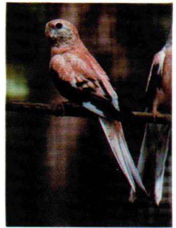
ROSE BOURKE PARAKEET