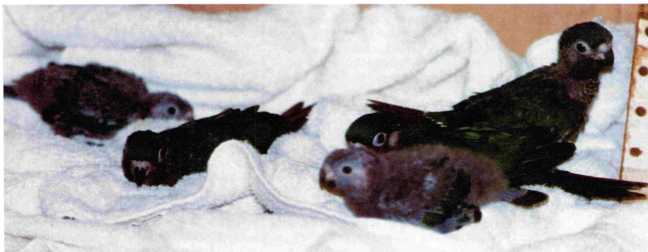
Currently available — young painted conures, Queen of Bavarias, and handfed suns and Jendays. These Painted conures were hatched at Norshore Pets August 10 thru 23, 1982.

PHONE ORDERS can be sent C.O.D., American Express, Visa or Master Card credit cards. (U.P.S. ADDS $1.65 C.O.D. fee to the above charges). We stock a complete line of T.F.H. bird books, plus books on waterfowl, pheasants, bantams, pigeons and other bird publications. VITA-LITES, HEADSTART Poultry Vitamins, Electric Foggers, AVITRON in ½ ounce, 1 ounce, 2 ounce and 16 ounce sizes. NUTRO CAGE AND AVIARY SPRAY in 8 oz. and 16 oz. sizes with sprayer attached. Also in economy size gallons. PREVUE/HENDRYX and CROWN cages. WE NOW STOCK SILVER SONG MIXES, DIETS, BOOSTERS AND MINERALITE, NORSHORE PETS PARROT MIX, KELLOGG'S PETAMINE, BUDGIMINE AND OTHER KELLOGG MIXES. NUMEROUS OTHER BIRD ITEMS IN OUR NEW AUGUST, 1983 catalog. PLEASE send $1.00 for catalog and price list. Refundable with first order.