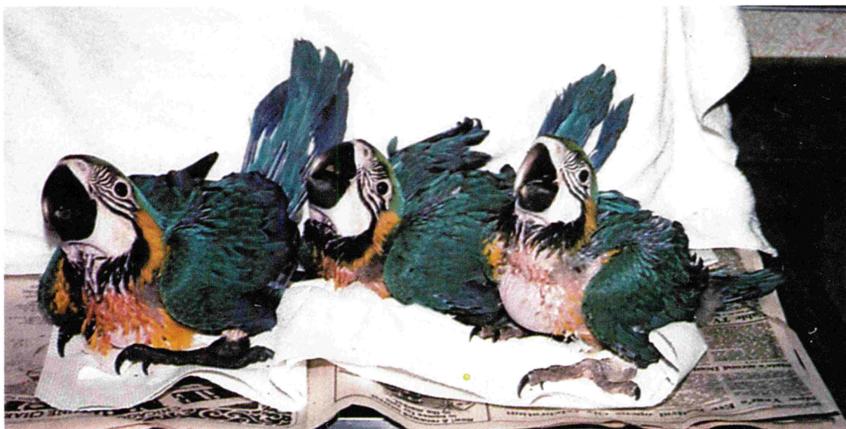
These Blue and gold macaws were hatched at Norshore Pets November 8, 12, and 15, 1982.