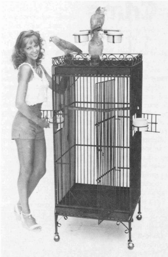
"THE AMAZON DELIGHT" 24" x 24" HEIGHT-52" or 58"

Buy Direct From the Designer & Manufacturer of the World's Best Cages