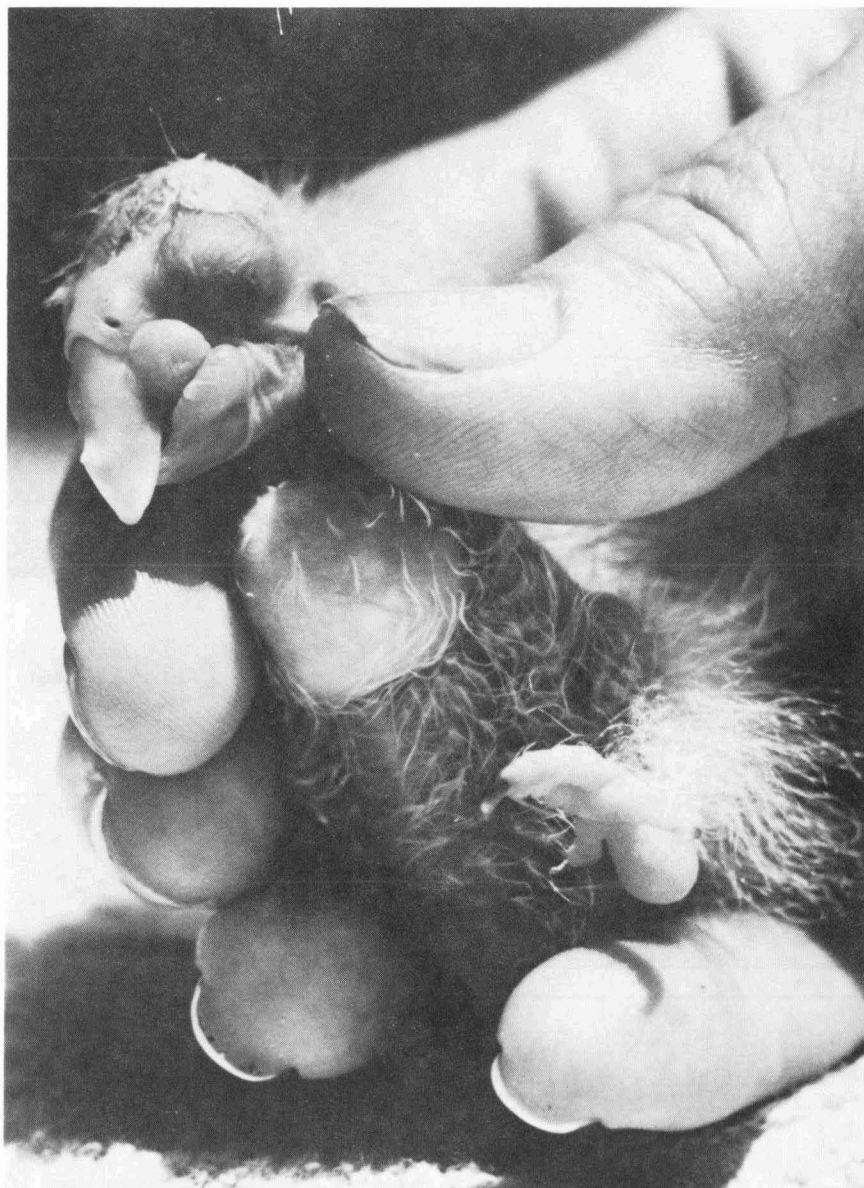
Ugly Duckling? Actually this tiny featherless creature is a newly hatched Lear's macaw, the first of its kind to be hatched in captivity throughout the world. The baby, which debuted recently at The Dark Continent, Busch Gardens in Tampa, is one of many rare species of birds being bred at the African-themed park.