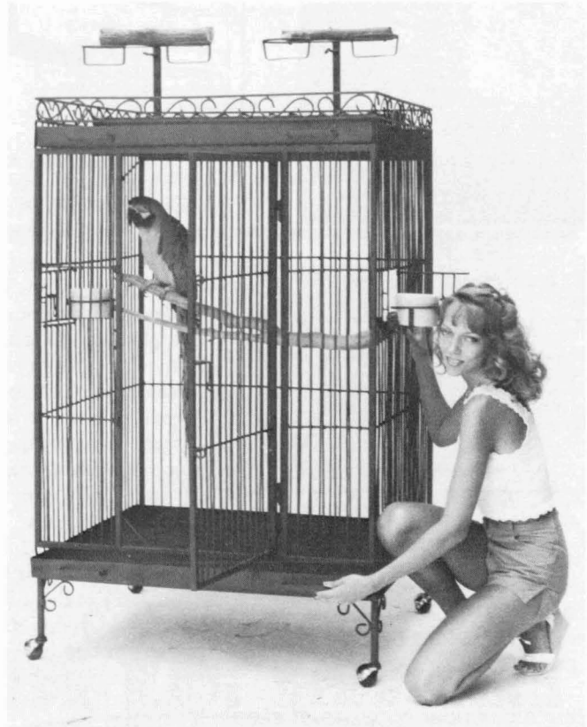
"THE MAJESTIC MACAW" 58" TALL X 36" WIDE 24," 30" or 32" DEPTH

I nglebrook Information 194 Eastern Avenue Pasadena, Calif. 91107 (213) 681-9785