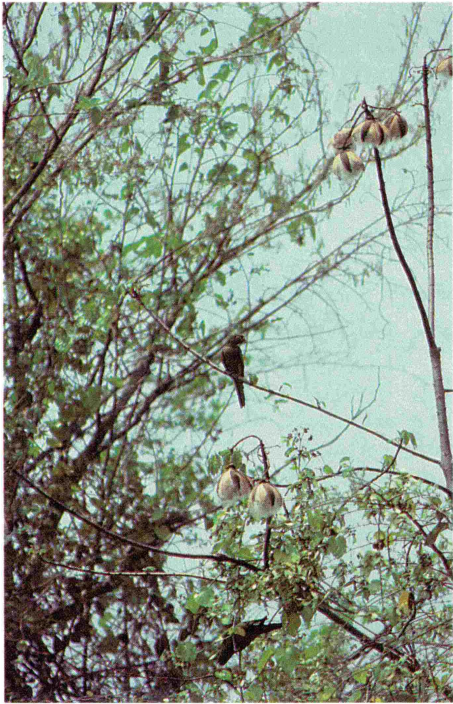
Astec conure (also called olive-throated parakeet) in a tree on a forest border in Belize, Central America.

guides who have travelled through the species range for a number of years, also indicated that the populations are on the decline. Probably, we still have many more years in which to study these interesting conures and build up their captive populations. ●