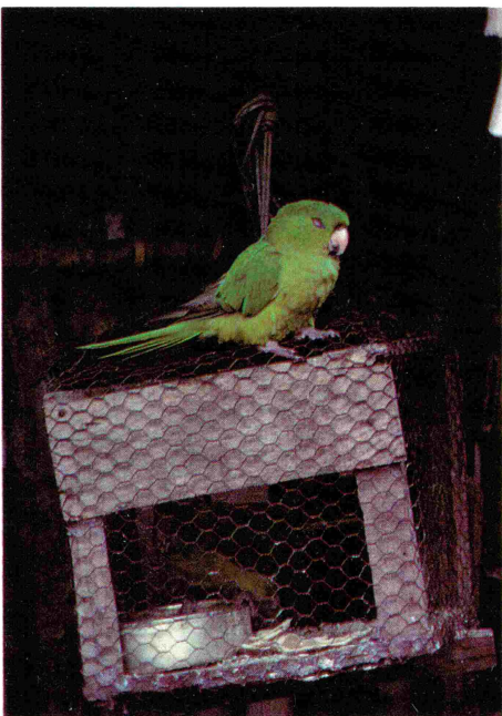
Two green conures kept as pets in a village in northeastern Mexico. Conures are seldom kept as pets when other psittacines are available.