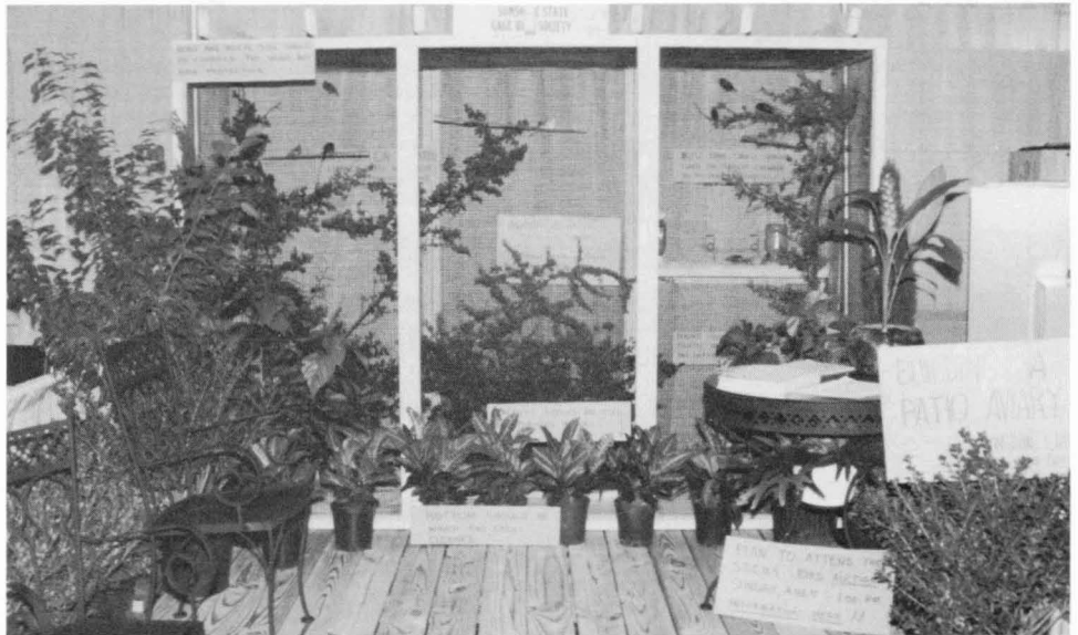
First place club booth winner — Sunshine State Cage Bird Society, Orlando, FL., featured a cleverly constructed garden patio aviary filled with beautiful birds and plants.