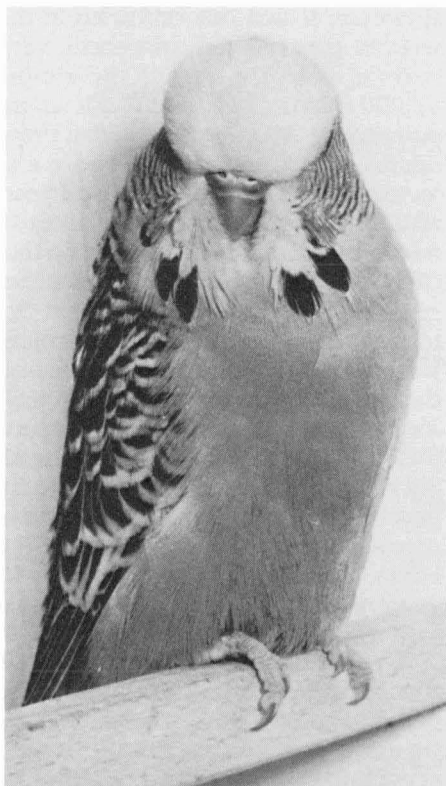
One of the Pilkington's champion budgies.

They are currently the champion breeders in the United Kingdom. As witnessed by their virtual sweep of the 1982 and 1983 World Shows. They are acknowledged as having the current best stud in England. Beyond that they have written extensively concerning the production of exhibition budgerigars. They are well-versed on all