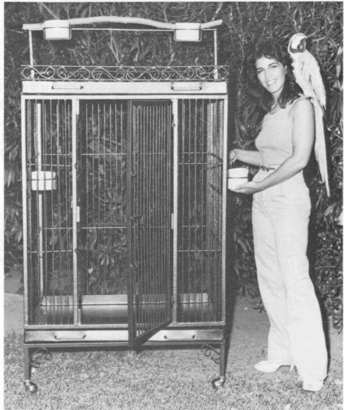
"THE MAJESTIC MACAW" 58" TALL X 36" WIDE 24," 30" or 32" DEPTH