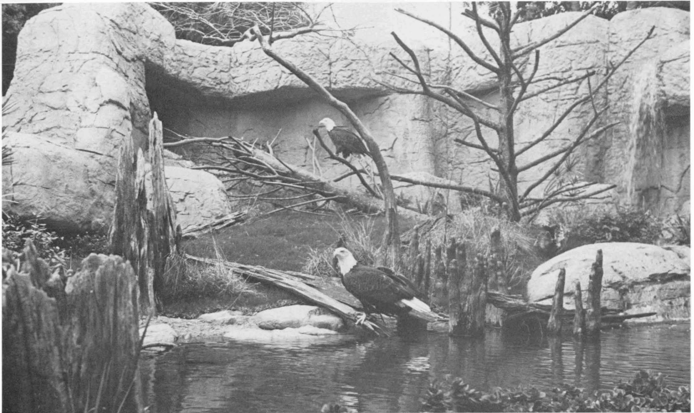
Exploring his new home — With a piercing gaze, a stately bald eagle scans his environs in the new Eagle Canyon display at Busch Gardens, The Dark Continent, in Tampa, Florida. The display houses two bald eagles, both male, and a mated pair of golden eagles, in a setting constructed of weathered woods, a rippling moat and Southeastern mesa-like rock abutments.