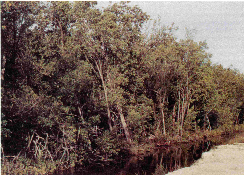
Habitat of the Cayman Amazon at North Sound on Grand Cayman Island.

crowned pigeon Columba leucocephala and white-winged dove Zenaida asiatica ), are far more numerous and consequently easier to bag. Certainly their flesh would be more palatable than that of parrots. The two caymanensis were so free of fear that attempts to startle them were ignored altogether. I threw stones at a tree several times, but they looked askance as if to suggest that it was futile.