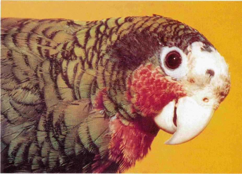
A male Cayman Island Amazon parrot. Note how each green feather is edged in dark grey.