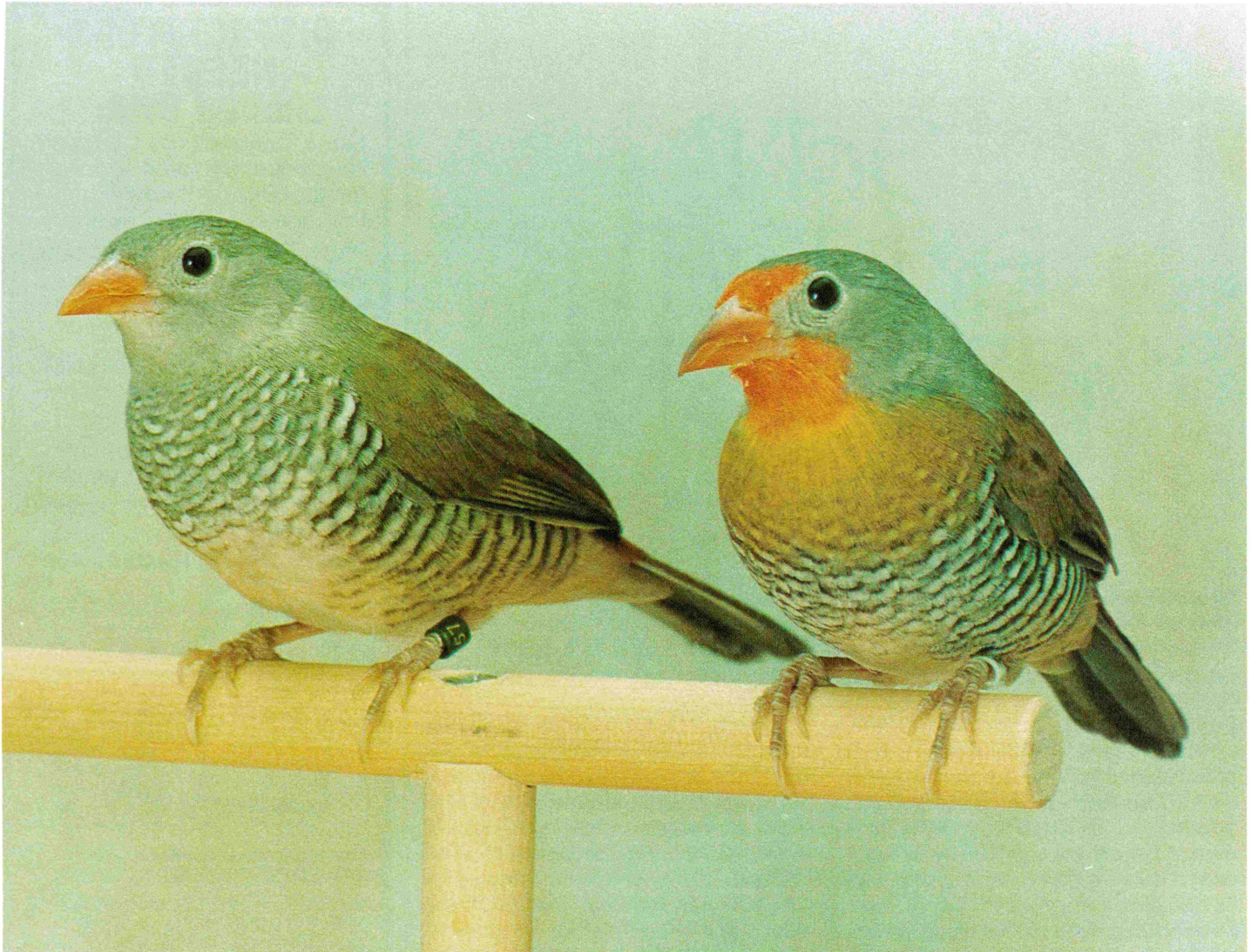
A pair of melba finches showing an obvious sexual dimorphism with the male being much more colorful.

can come as a surprise to those familiar with the other waxbills, for the melba finch can truly be classed as a songbird.