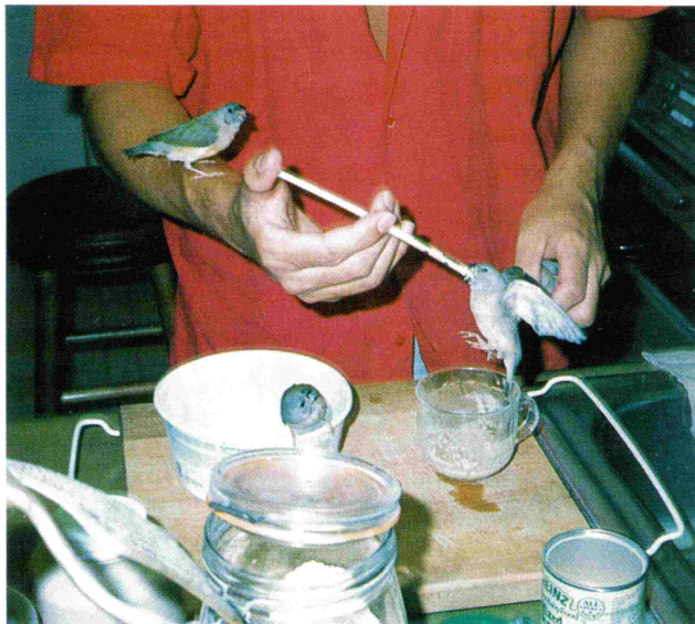
The young Gouldian finches learned to fly to and hover near the feeding syringe.