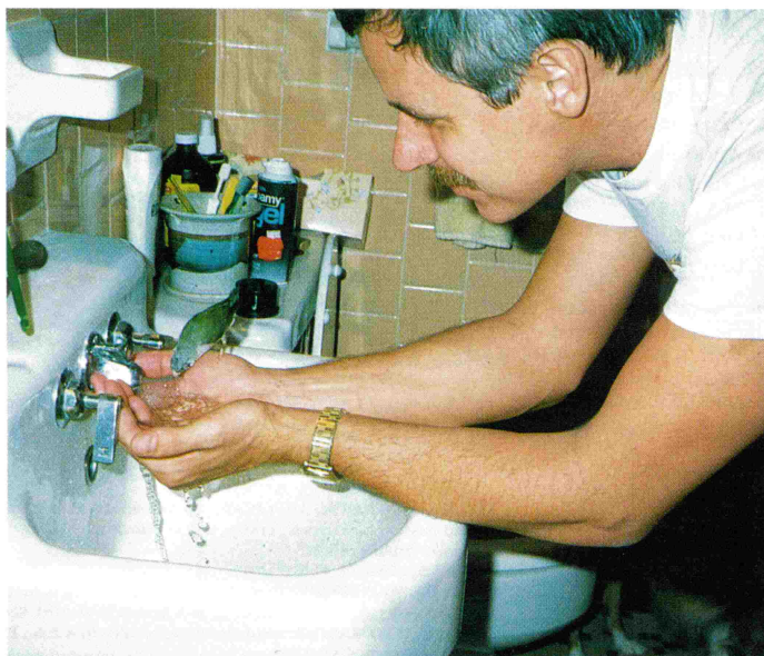
Cupped hands make a perfect bathtub for Peaches.