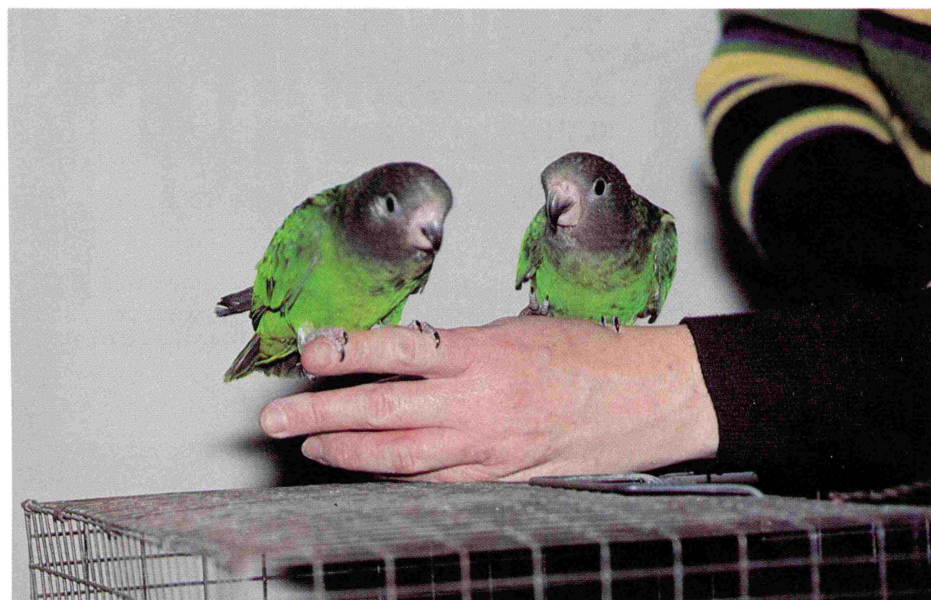
Hand fed chicks become quite tame.

they were laid. I put the eggs in our incubator in the house. At this time candling the eggs revealed nothing, just clear looking eggs with a healthy looking yolk and shell. After the eggs were in the incubator for three days, I candled them with our Proble-lite egg candler and it was obvious that both eggs were fertile. Apparently the hen was not incubating her eggs, otherwise the eggs would have shown some signs of life by the time I brought them into the house.