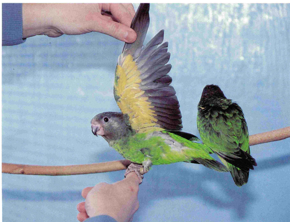
Brown-headed parrot chicks (Poicephalus cryptoxanthus) just weaned.