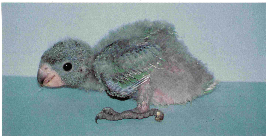
A brown-headed chick at 47 days of age.