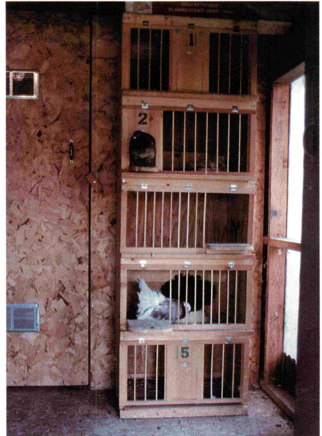
This bank of nest boxes has varying width doors to accommodate different pigeon breeds.

can feel a sense of true accomplishment. (Now what other bird could offer such a challenge?) With each new season you will add another layer to the foundation of knowledge and another year of fascinating fun to your life.