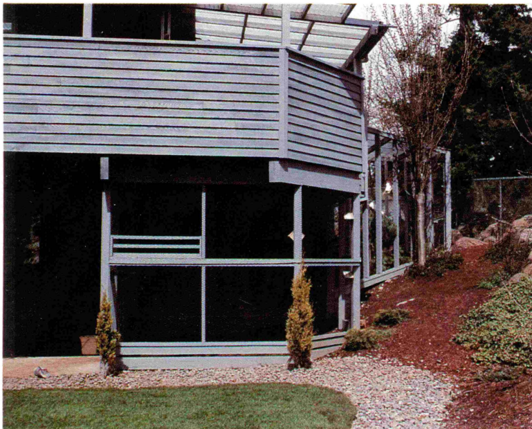
Don't let the term "loft" fool you. With imagination, a pigeon house can be attractive.