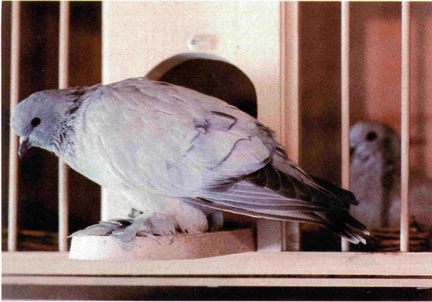
An ice pigeon cock guards his domain while the hen hovers over her eggs.