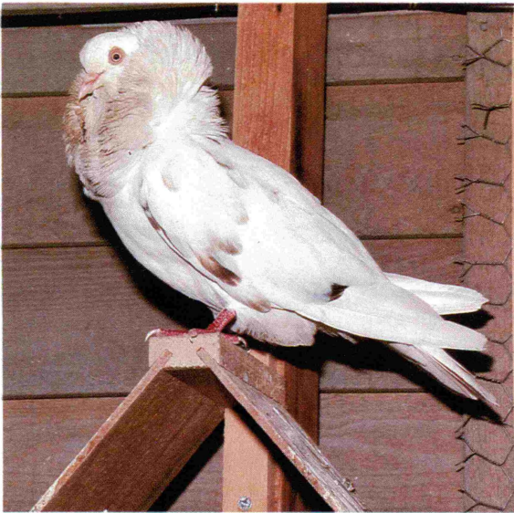
Using an inverted V perch helps facilitate clean up. An Old Dutch Capuchine, one of the "fancy" varieties, is shown.