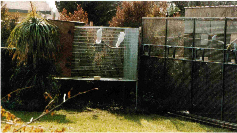
The aviaries on the right are constructed of steel, wire and wood and situated on a cement slab. The simple cage in the center is nothing more than a wire box on legs with a plywood cover on one end. The birds seem equally happy in both types of containers and breed as well in one as in the other.