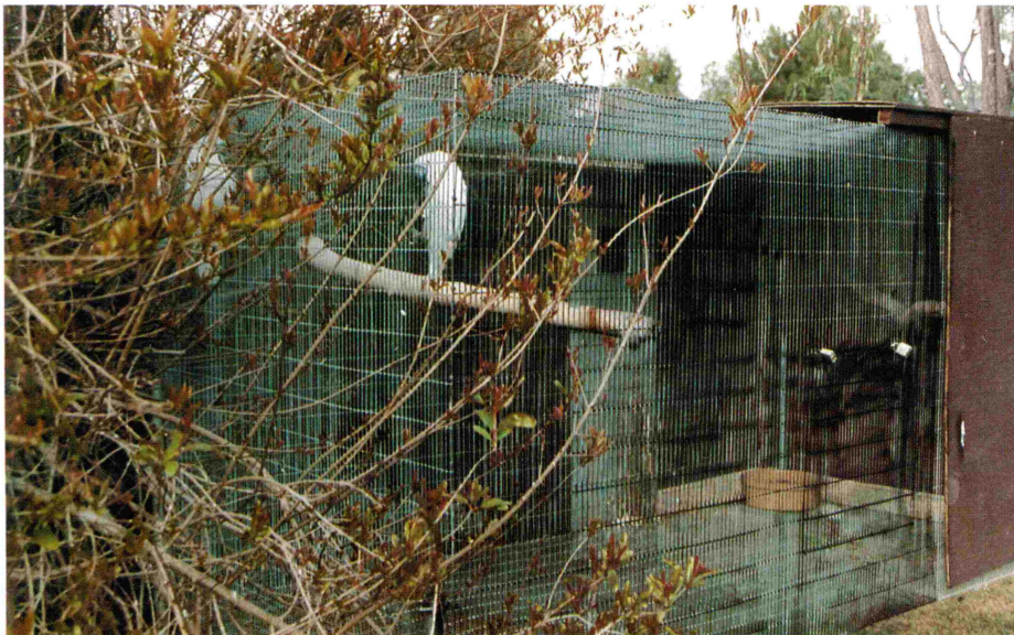
This breeding cage is seen from the open end showing the feed crock under the shelter, the opening to the nest box, the padlocks used to secure the access door and the pair of umbrella cockatoos whose home it is. The birds were happy and content enough to raise a beautiful baby last year.