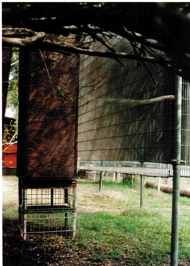
This nest box is made of 3/4" plywood for insulation and is lined with heavy gauge sheet metal so the birds can't chew out. It is wired to the cage.

would prevent a compatible pair from breeding. In our experience, the simple "Noegel" cage as described here provides a basic environment that will not inhibit birds that want to raise babies. Such cages are simple, inexpensive, easy to make, and are worth a try if you live in a moderate climate. ●