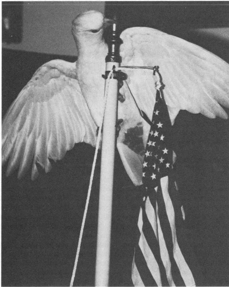
Antics on the flag pole.

"Houston" was born May of 1985, at this writing is one year old and it arrived seven months ago via air freight. I was rather apprehensive about having a hand-fed baby shipped but it was the only way I could get this precious cargo to Florida. At five months the red vent's rump feathers (grows from the rump and covers the area a tad above the vent) are a pale salmon in color, white in the adult. The eyes had a brown iris. No sign of tiny feathers on the cere or nostrils. At one year the cere has the protective feathers about the nostrils and top of cere. The iris is now a charcoal grey. The blueish skin which surrounds the eyes is now white in color.