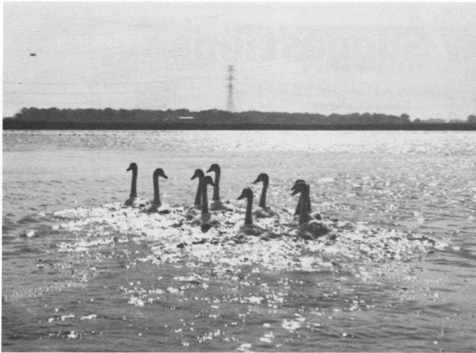
The only solution to the disappearance of fine swans such as these is poaching. They kept to the water, could not fly, were too big for predators, but could be easy to trap at night with a net.