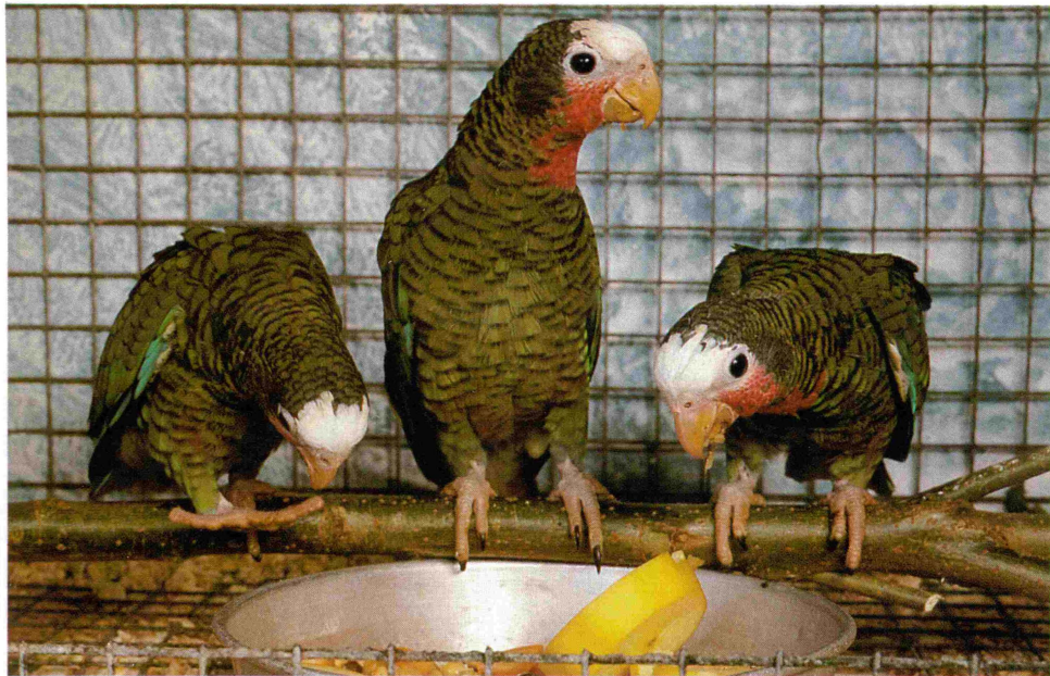
Cuban Amazons, Amazona leucocephala leucocephala , finished weaning, on their own.