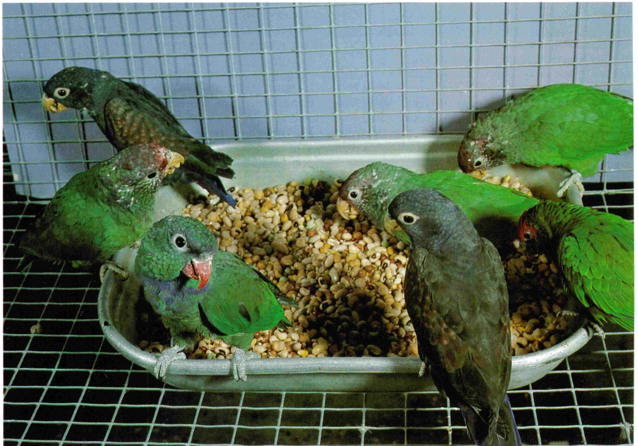
A group of pionus.