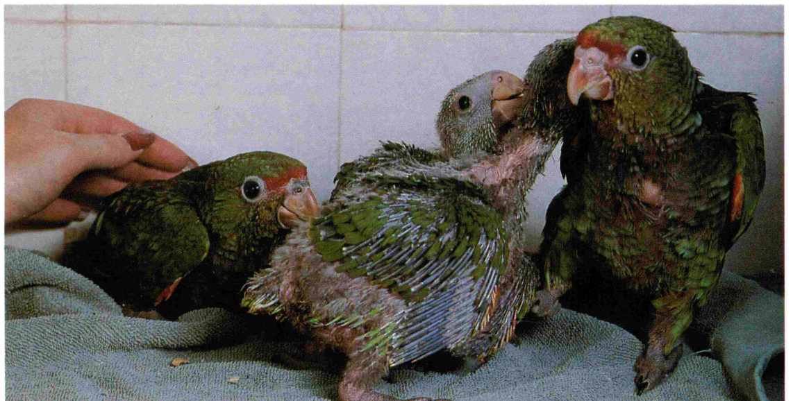
Amazona vinacea , very significant. Note how much difference in development there is in this nest of four.