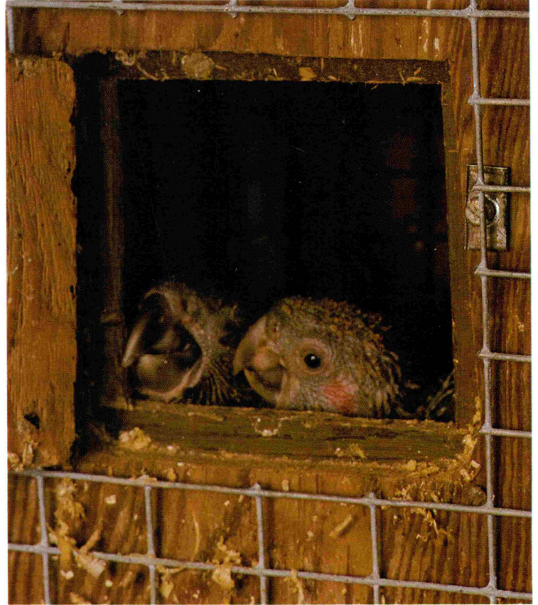
Easy nest inspection is essential. Two Ara rubrogenys (red fronted macaws) raised by an odd colored blue fronted.