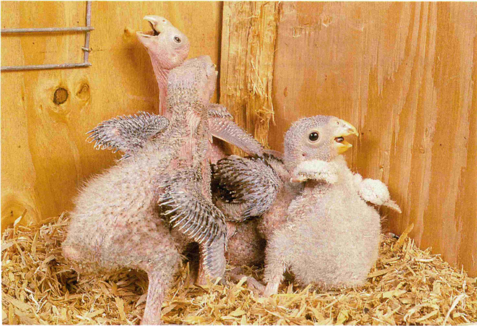
Mixed nest (double yellow head, white front Amazon, bronze winged and plum crown pionus).

the early part of the day is that an eye can be kept on the nesting pair to ensure that the hen continues to set her eggs or brood the young, as the case may be. New laid eggs, that is, eggs that have not been set, can be warmed for a few hours or even over night in a hospital cage before they are put in the nest of the sitting surrogate hen. Eggs that have started development need to be kept at about 98.5 °F (36.9 °C).