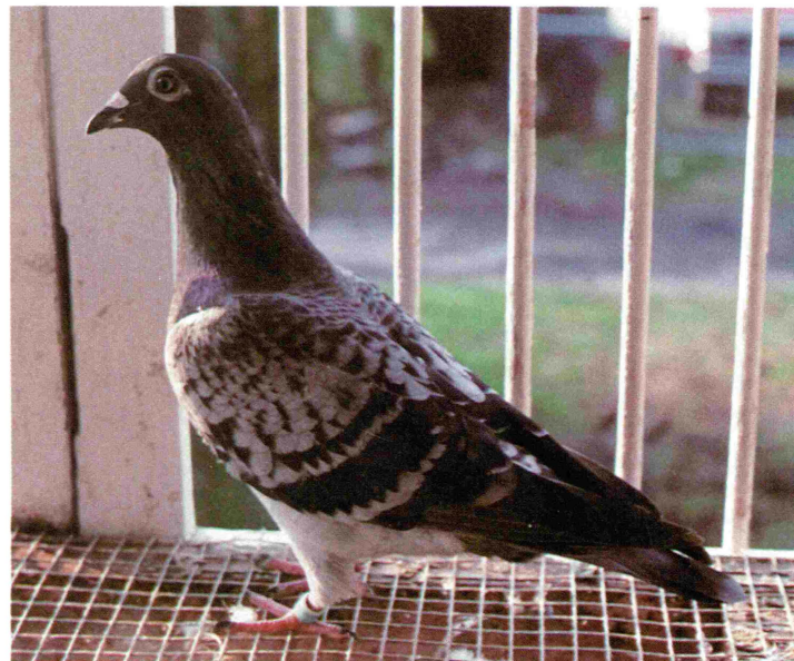
Gallant Lad — foundation cock.

Blue checked hen — one of Rutter's top young birds this year. This bird flew over 2,000 race miles and has won several diplomas.