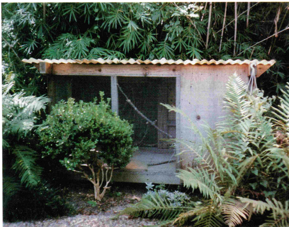
The silent aviary.

I hated it. I grieved and blamed myself and decided I would do everything differently the next time. Surely there would be a next time.