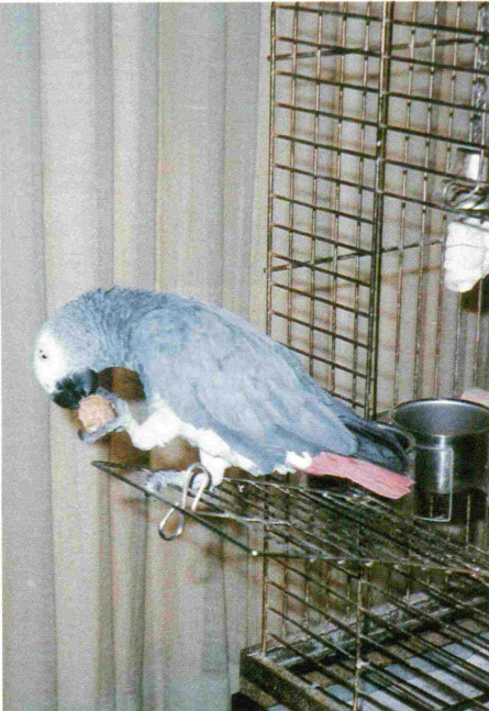
Cap'n Flint on the gangplank, the number one bird in my life now.

My first birds were button quail. Upon seeing a handful of the tiny babies running around in an aquarium, I was hooked and in love. A few weeks later I bought my first pair of birds.