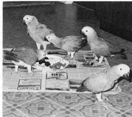
African Grey Parrots are one of the easier of the large parrots to reproduce in captivity and are extremely popular as pets.

The move to Florida gave everyone a rest. No eggs were produced for a year. The birds are now in 1/2" x 3" welded wire cages 3' x 3' x 6' long. Once again the birds are side by side, with plywood partitions between flights. Two 2" x 4" perches inserted in construction brackets, affixed with stainless steel nuts and bolts, make changing perches an easy task. Essentially half of the cage is protected from the elements. One end includes a perch to the nestbox, nestbox, and