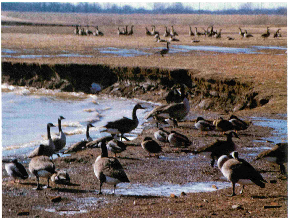
Wild geese become so tame they ignore the cameraman.

Is there a moral here? If there is, perhaps it is the fact that kindness, once offered, is universal, in both the human and natural world. ●