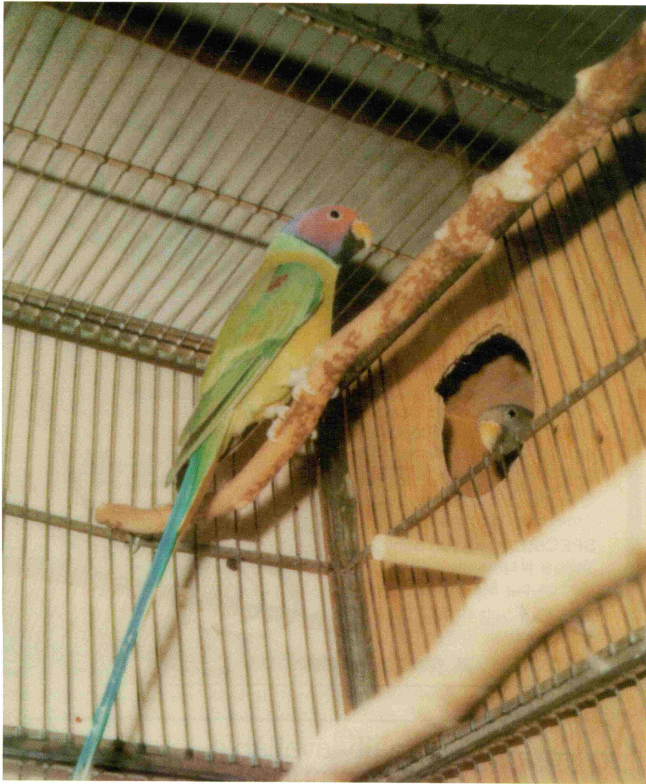
This breeding pair of plumheads finally felt comfortable enough to get down to business. They wanted their privacy and preferred a high, far corner.