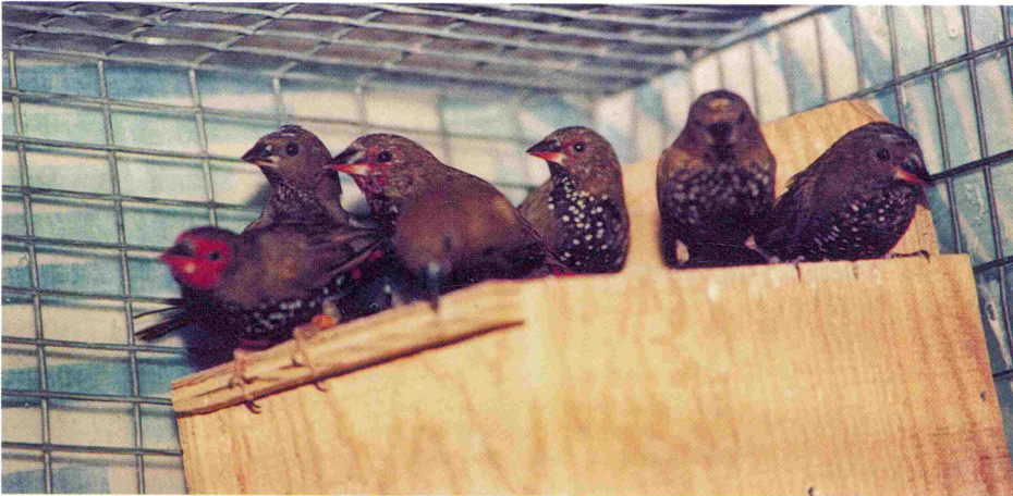
Young Painted Finches do not have the colorations as the adults until their first molt. In the wild, Painted Finches build their nests in spinifex grass.

The Painted comes from the arid inland areas of central Australia which extends through the Kimberley to the coast of northwestern Australia.