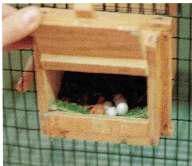
Each nest had two entrances. The inside one was used by the birds and the outside one was used by the keepers to check or remove eggs and/or babies. Society Finches were used as foster parents.