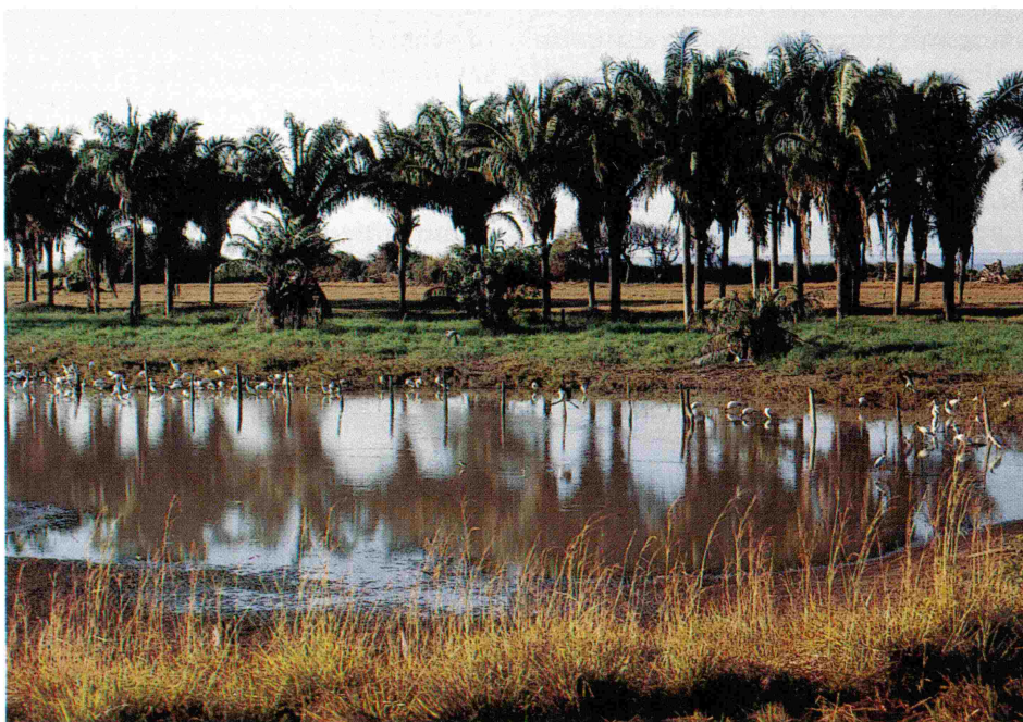
Waterfowl pond near Jaco. The ocean is in the extreme background.

People in Costa Rica, as in our own country, need to eat, have homes and work. The cost of everything imported is extremely high. Taxes are levied heavily on all imported items. The country is predominantly Catholic and population growth is a problem. Saving the virgin rainforest must be our main goal, reforestation a second choice. It is unlikely with the variety of flora in an acre to be able to replant all the varieties origin-