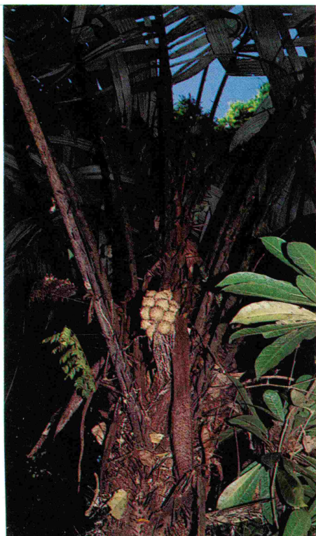
Tropical palm with huge nuts protected by sharp thorns.

People in Costa Rica, as in our own country, need to eat, have homes and work. The cost of everything imported is extremely high. Taxes are levied heavily on all imported items. The country is predominantly Catholic and population growth is a problem. Saving the virgin rainforest must be our main goal, reforestation a second choice. It is unlikely with the variety of flora in an acre to be able to replant all the varieties origin-