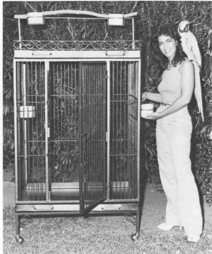
"THE MAJESTIC MACAW" 58" TALL X 36" WIDE 24," 30" or 32" DEPTH