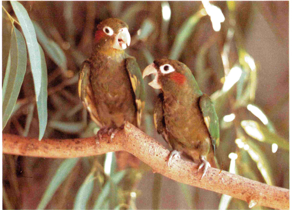
The first two Hoffman's conures raised in captivity.

I received the pair in question in early 1981 and had them surgically sexed. In May the weather was cool with highs in the upper 60s and rainy. May 5, 1981 the hen laid her first egg and three more followed. The eggs were laid in a plywood nestbox that measured 18"x9"x9", with three inches of material in the bottom. The boxes are checked periodically, often twice a day in the breeding season. The hen began sitting immediately and was very diligent. She remained tight on the nest for a full 30 days at which time the eggs