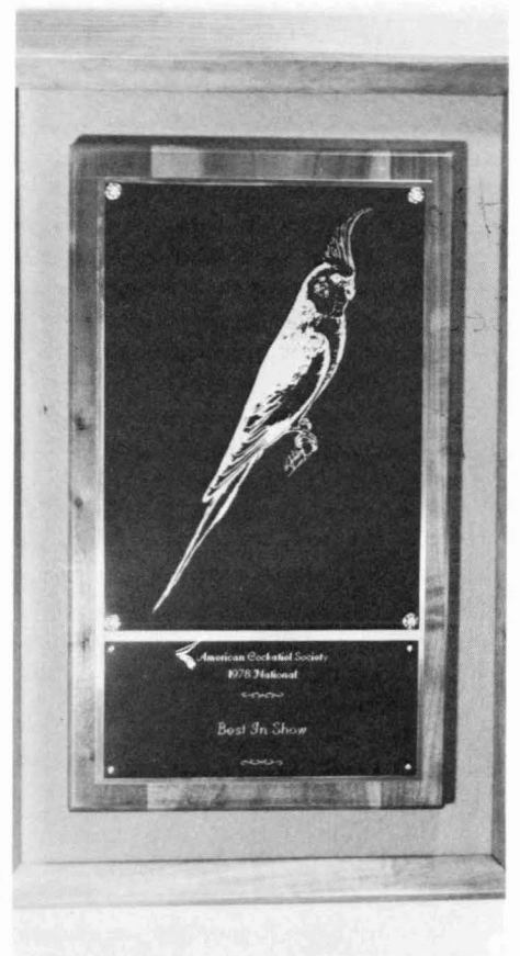
A.C.S. trophy for Best Cockatiel

More detailed information is given in A.C.S. Jan.-Feb. '79 bulletin, and blue prints for construction of show cage will be available shortly. The approved A.C.S. Show Cage will not become mandatory in exhibiting Cockatiels until 1984 (five years).