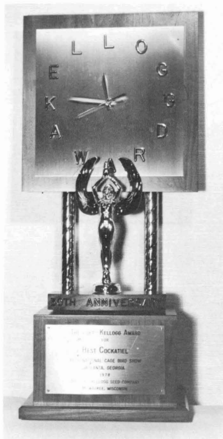
National Cage Bird Show's Best Cockatiel Kellogg Award.