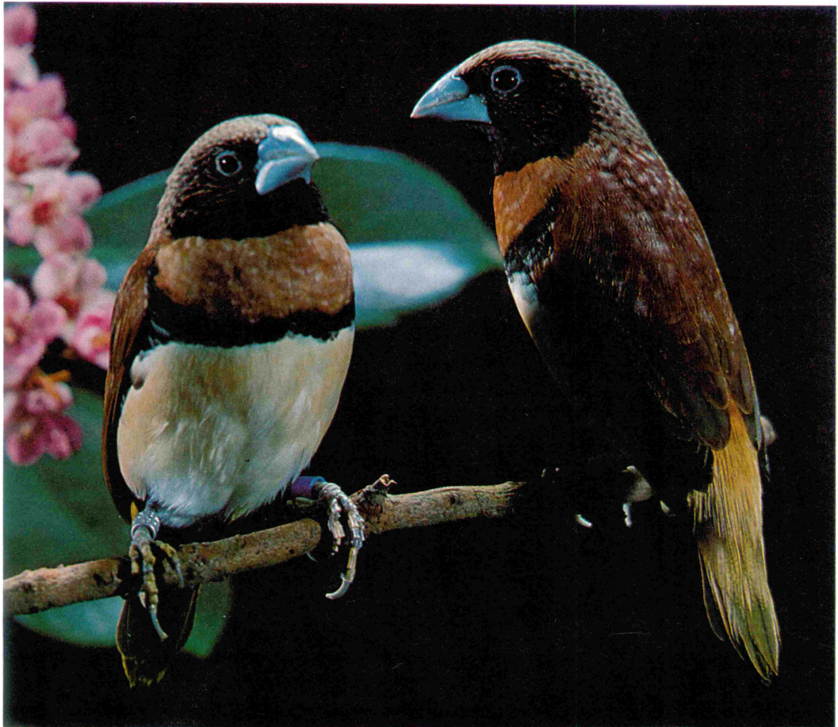
Chestnut Breasted Mannikins ( Lonchura castaneothorax ) N. Australia and New Guinea.