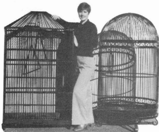
#235C 22" x 36" x 60"

ALSO CUSTOM MADE CAGES TO YOUR SPECIFICATIONS