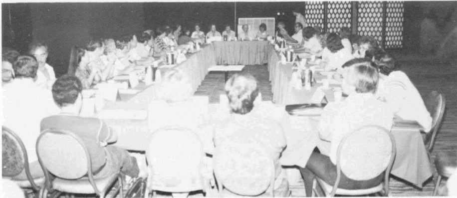
The board meeting produced many ideas for improving AFA and expanding its responsibilities.