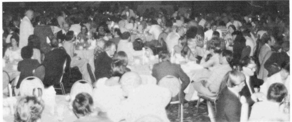
The Saturday night banquet with its excellent meals and great service was a pleasure for conventioners.