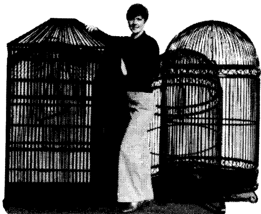
#235C 22" x 36" x 60"

ALSO CUSTOM MADE CAGES TO YOUR SPECIFICATIONS