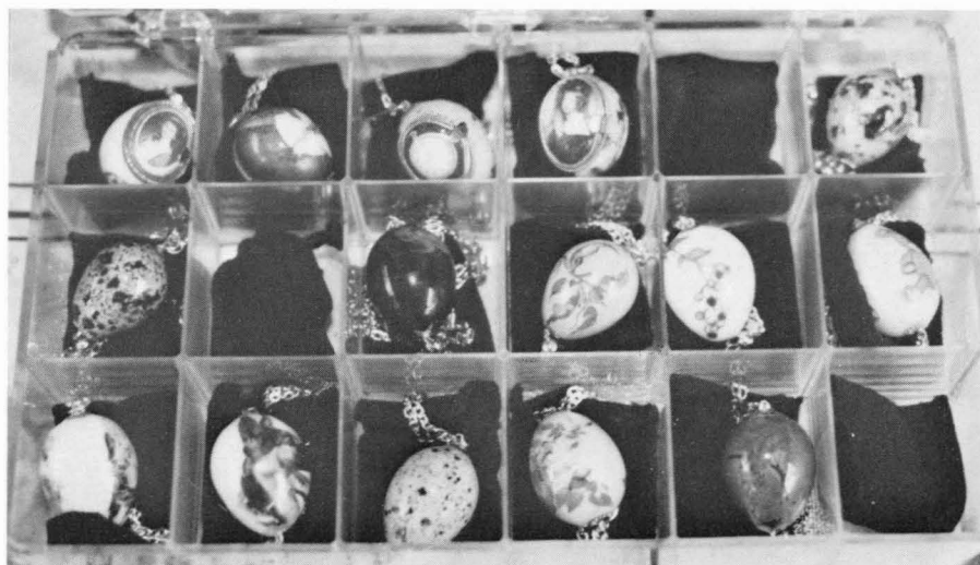
A wide variety of intricate work is displayed in these "Crossley Eggs"