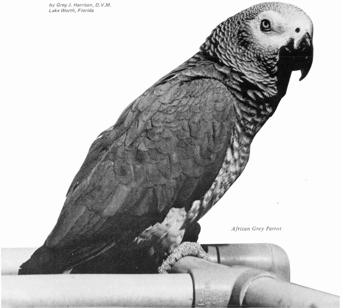
African Grey Parrot

After carefully looking over the two birds in front of me, I told the owners that I felt confident that they had a pair