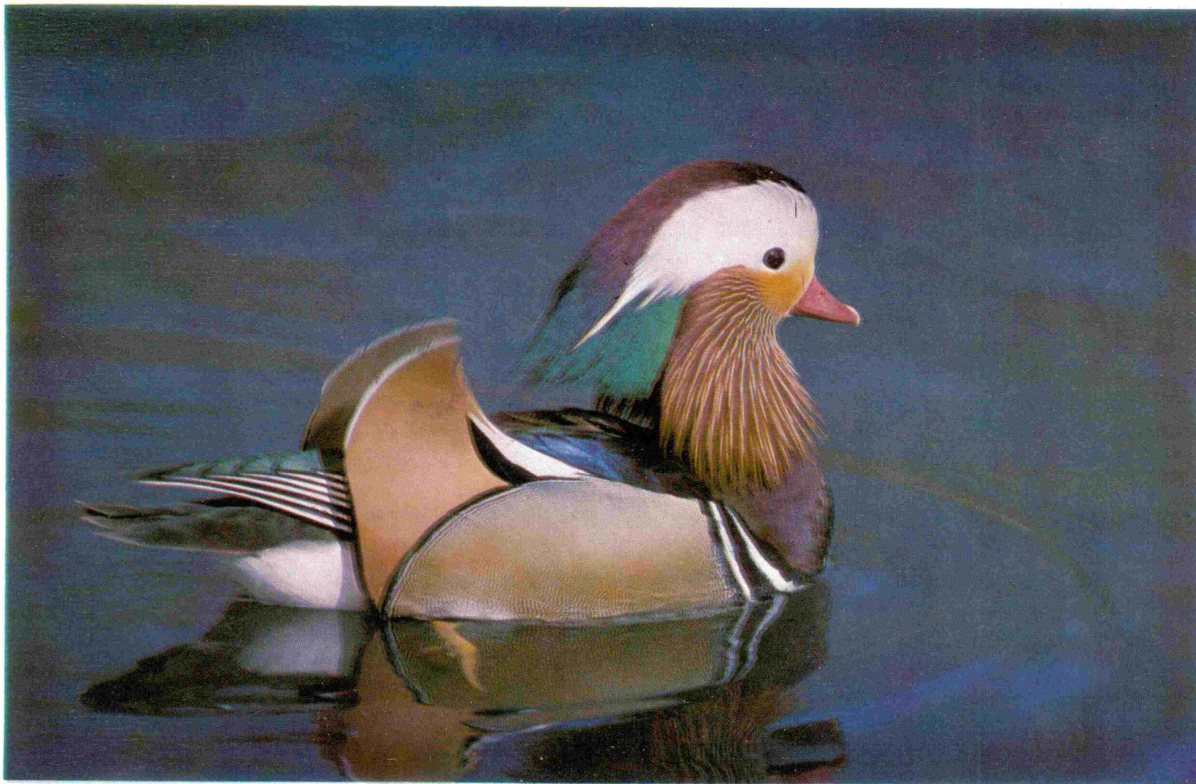
Mandarin Drake (Aix galericulata)