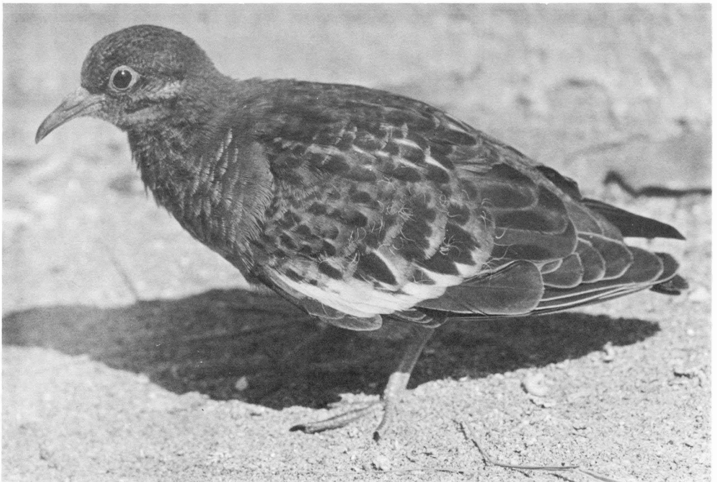
Galapagos Dove, young.