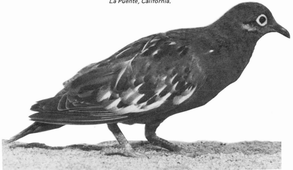
Galapagos Dove (Nesopelia galapagoensis) male.

by Sheldon Dingle La Puente, California.