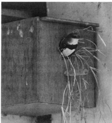
Hen using nest box.

In captivity their natural diet can and should be duplicated. A variety of dry seeds including Canary, Proso, large and small red millet, and the smaller finch millets should be offered as the main