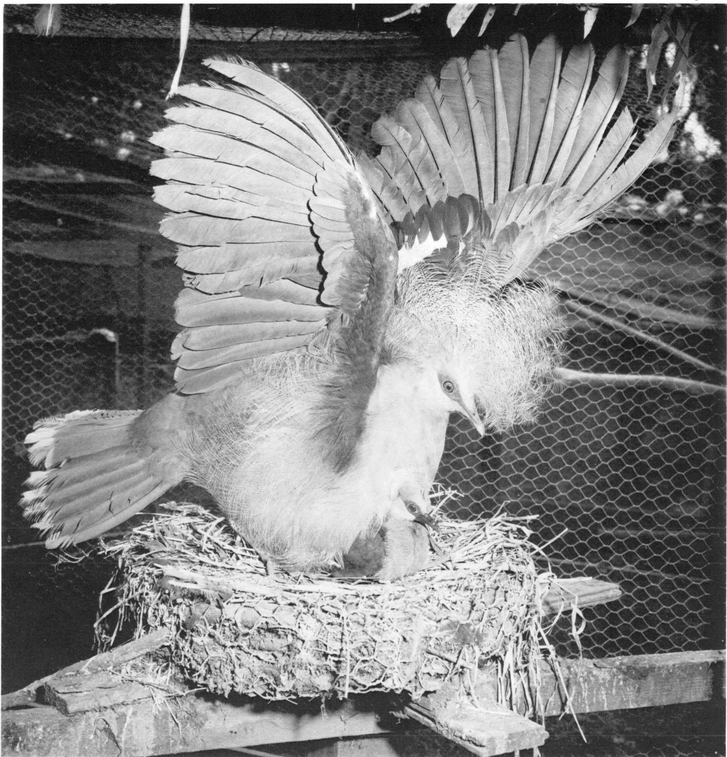
Blue Crowned Pigeon, Goura cristata cristata. With chick 14 days old. Northwestern New Guinea (West Irian). Eucalyptus and wire woven artificial nest, six feet in height.