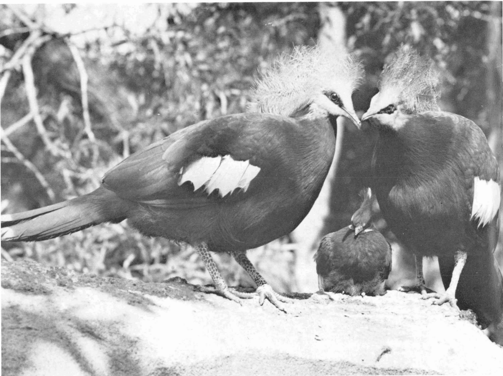
Maroon-breasted Crowned Pigeon, Goura scheepmakari scheepmakari. Southern coast of Southeastern New Guinea from Hall Sound and Mt. Epa eastward to Orangerie (West Irian). Chick, five weeks old. Male, left; female, right.