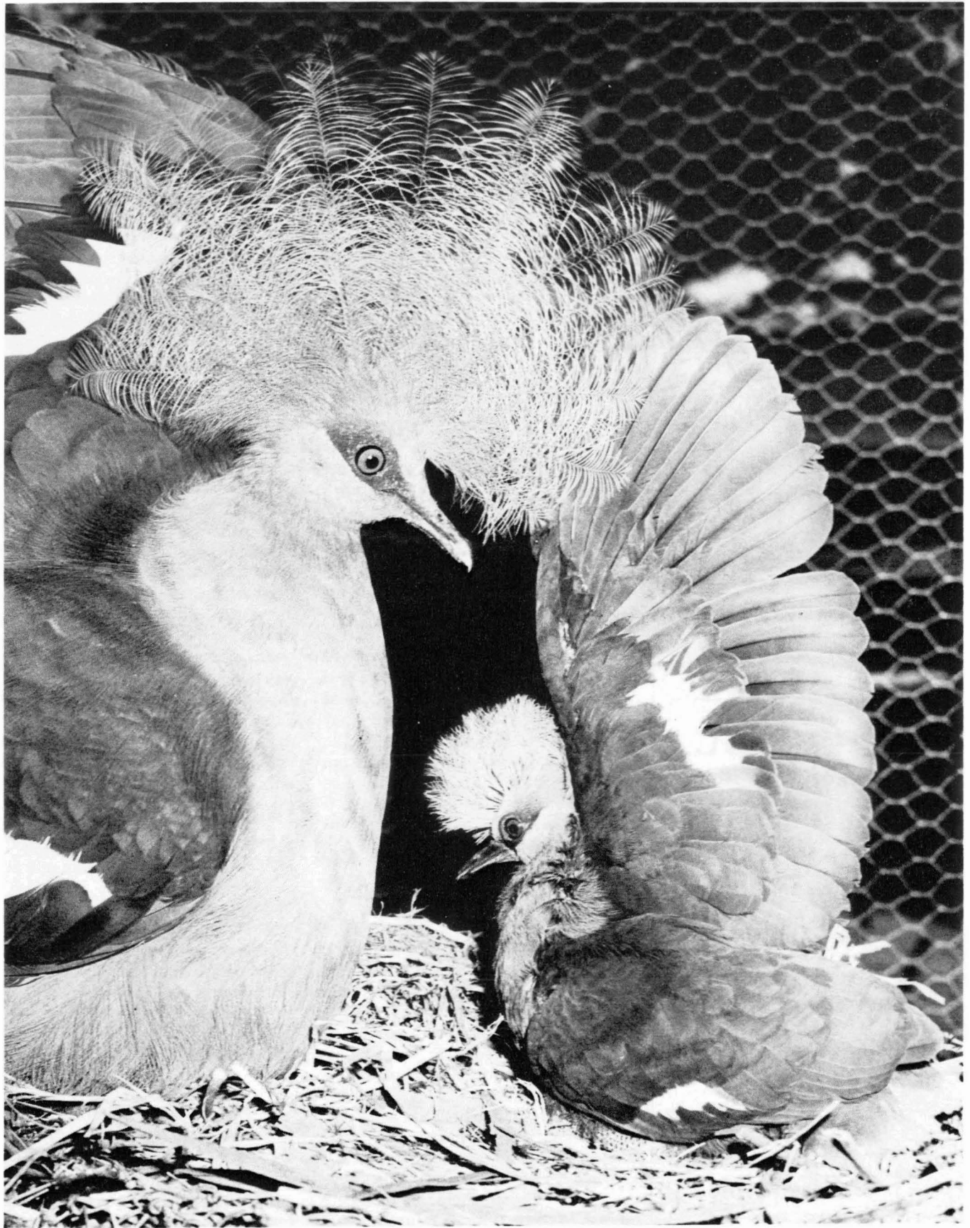
Blue Crowned Pigeon. Goura cristata cristata. With chick 28 days old, Northwestern New Guinea (West Irian). Aggressive display of male and chick when approached in nest.