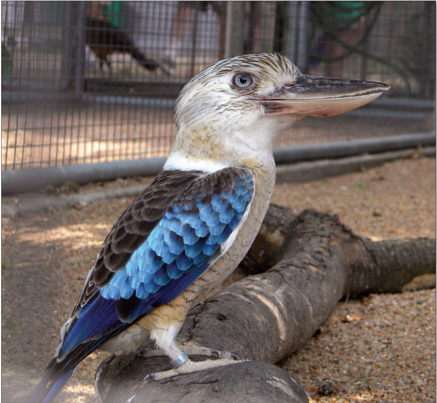
A Blue-winged Kookaburra from Australia at the Houston Zoo.