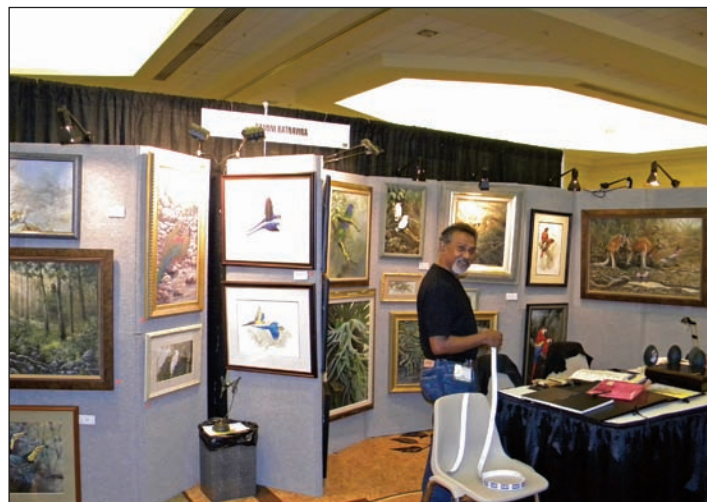
Art Gallery and Nature Center, tends to his booth during the Convention.