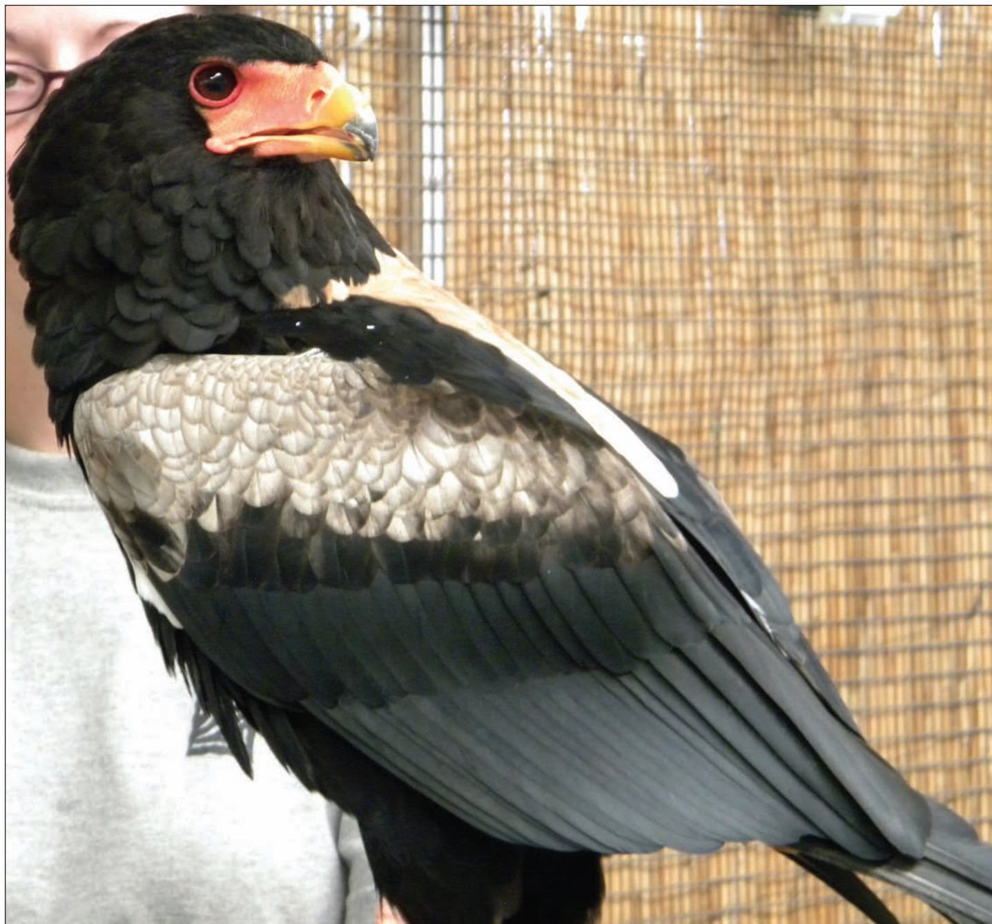
Baetluer Eagle at the Houston Zoo.

softbills, ground birds, and many others. At the end of the tour, each group was led in to inspect the incubation room where selected eggs were hatched, to view the kitchen where the fresh produce and protein diets were prepared, and see the working facilities where the staff conducted daily activities. A group of high school students involved in a program for credit were currently busy at one table working on their observations and studies.