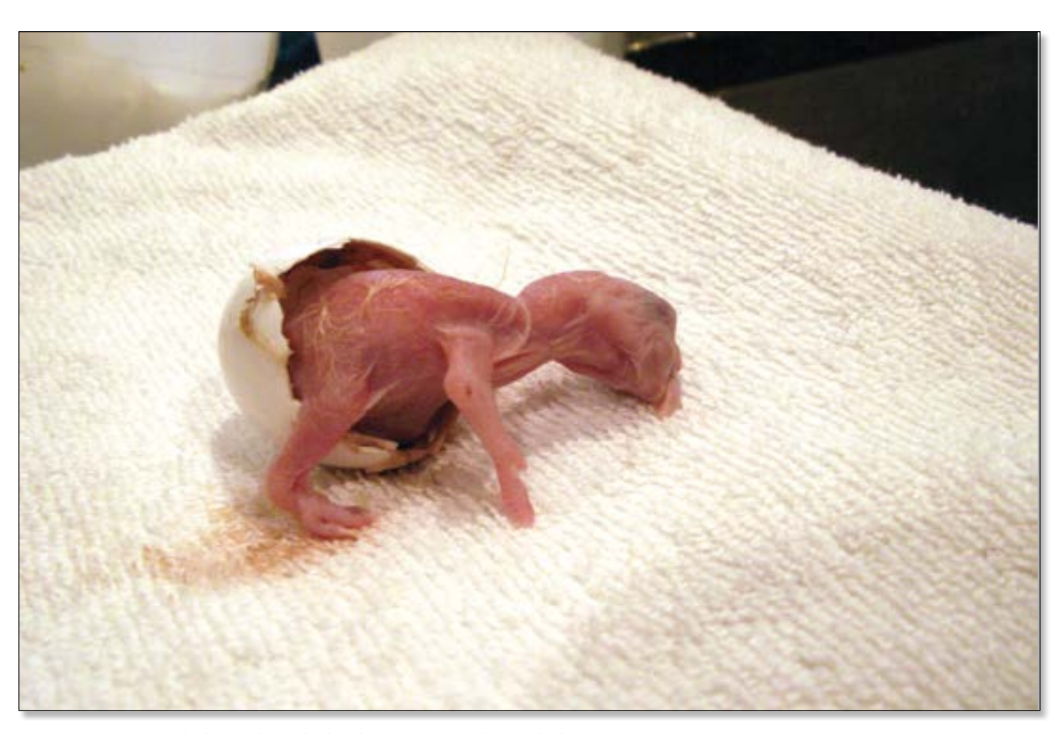
Mark Moore / Macaw chick completes the hatching process with just a little assistance

out of the nest. Covers should have a very small hole drilled in both ends of the cage at the same time. the middle to entice the birds to begin enlarging the entrance. they end up chewing or working the box together. For whatever reason, maybe the bonding that takes place between the pair during the enlargement of the nest entrance, or some needed extra time for maturity, this little trick seems to get many difficult pairs into breeding condition. The good news is that, at least with Green-winged macaws, it is common that once you get them to breed, they become fairly consistent breeders and will often nest regularly.